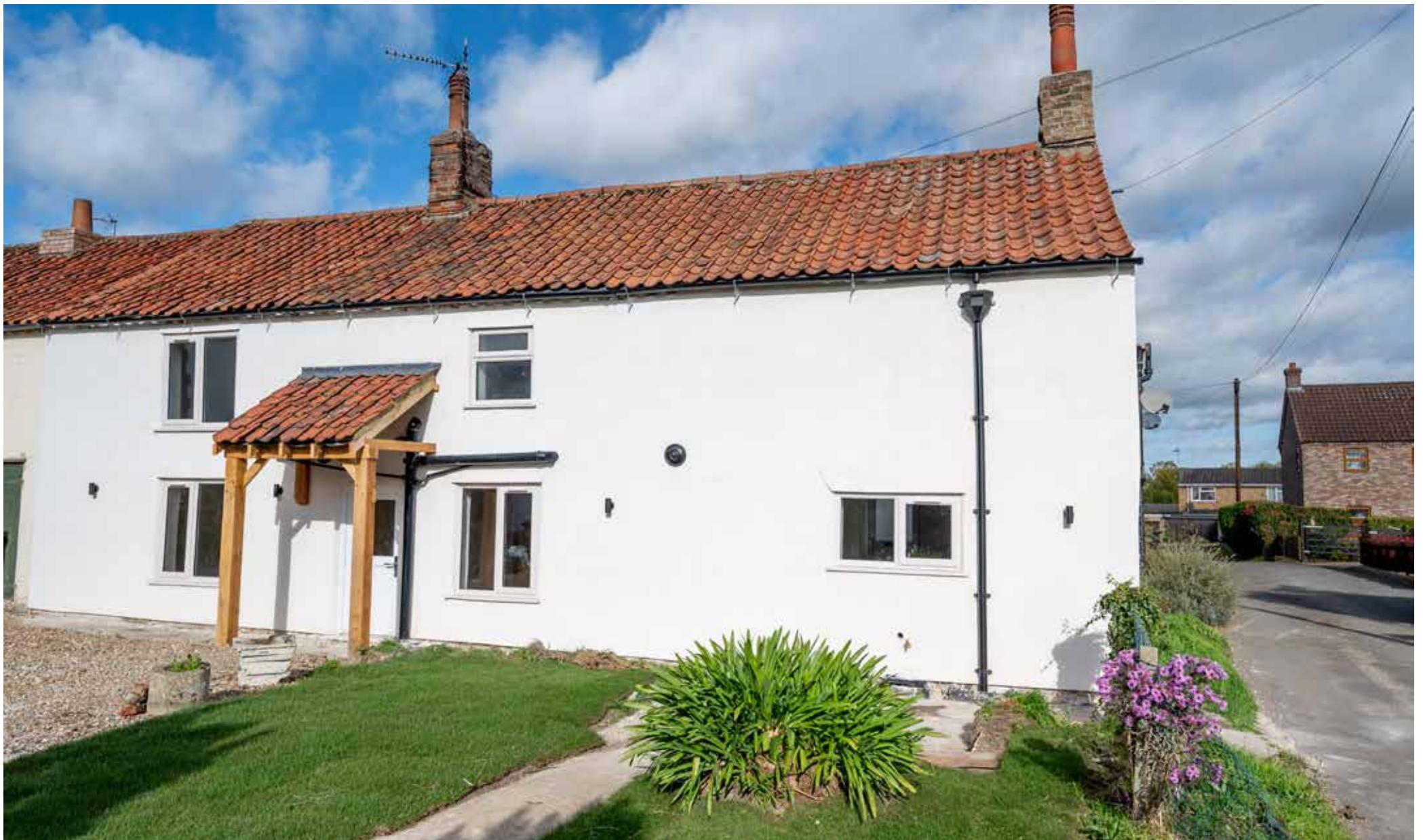
Beryl Dene Hilgay | Norfolk | PE38 0JD