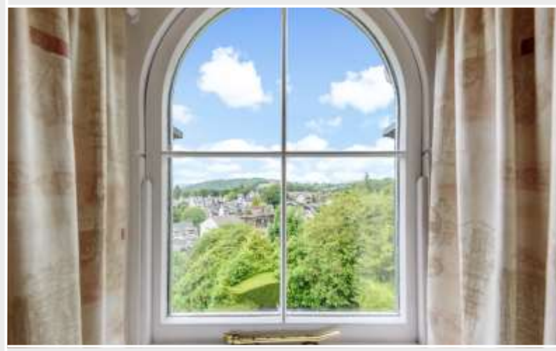
Living room view