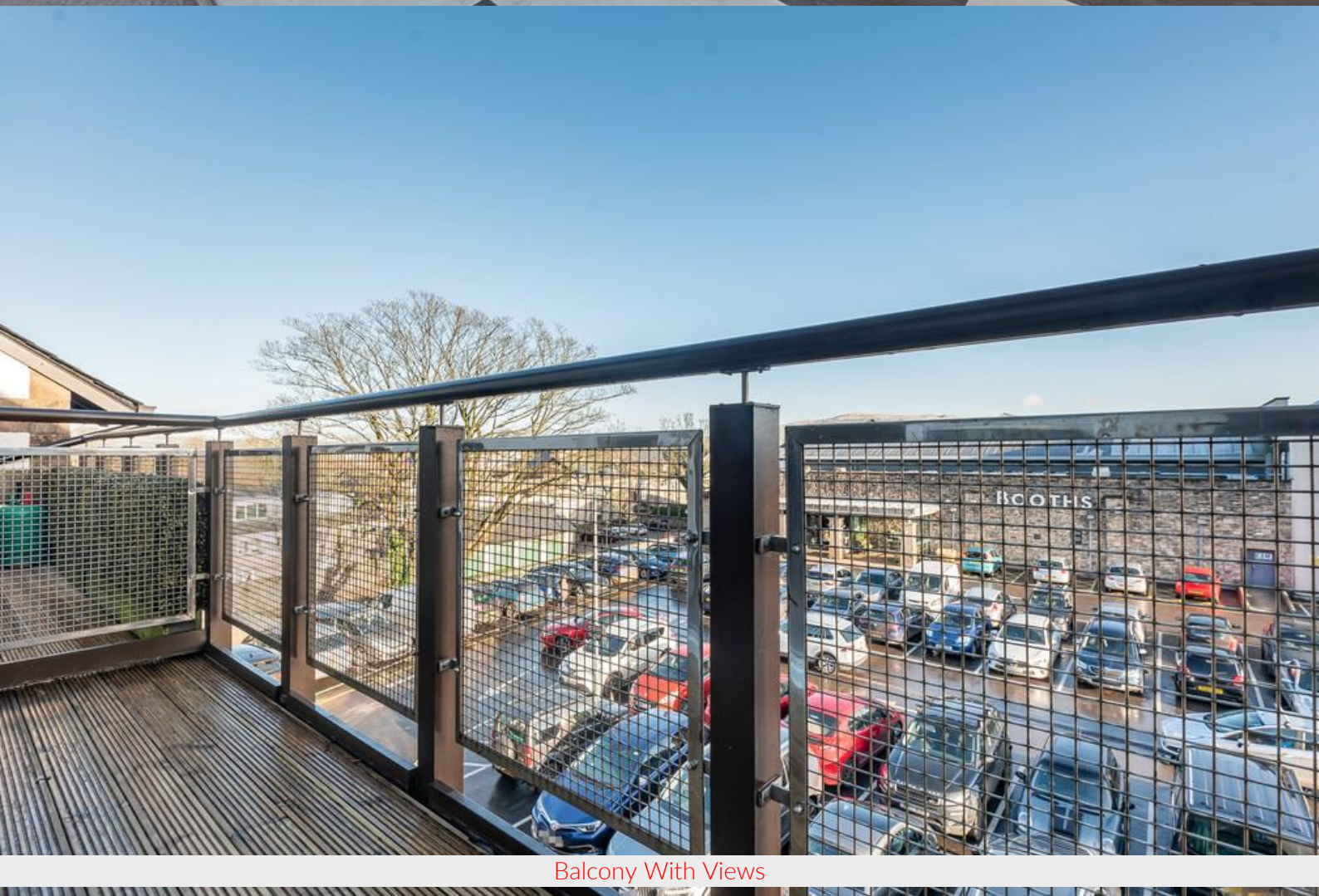
Balcony With Views