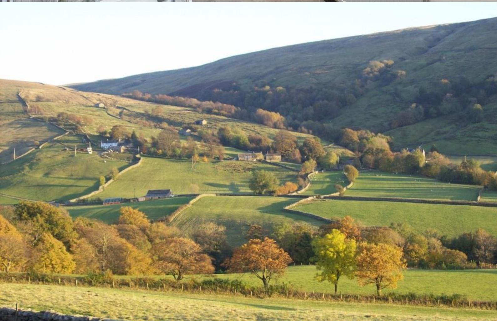
View from Broadfield