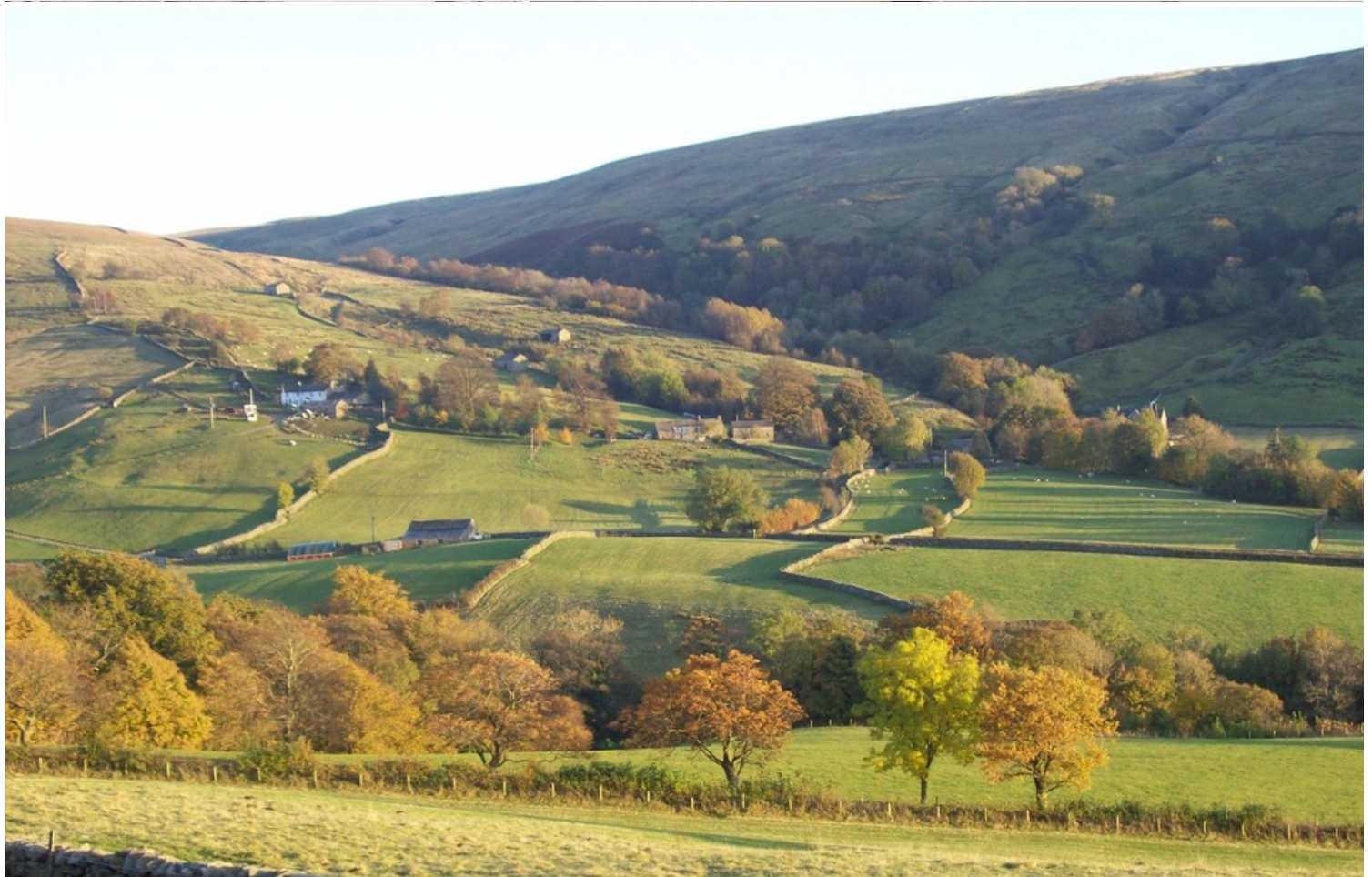
View from Broadfield