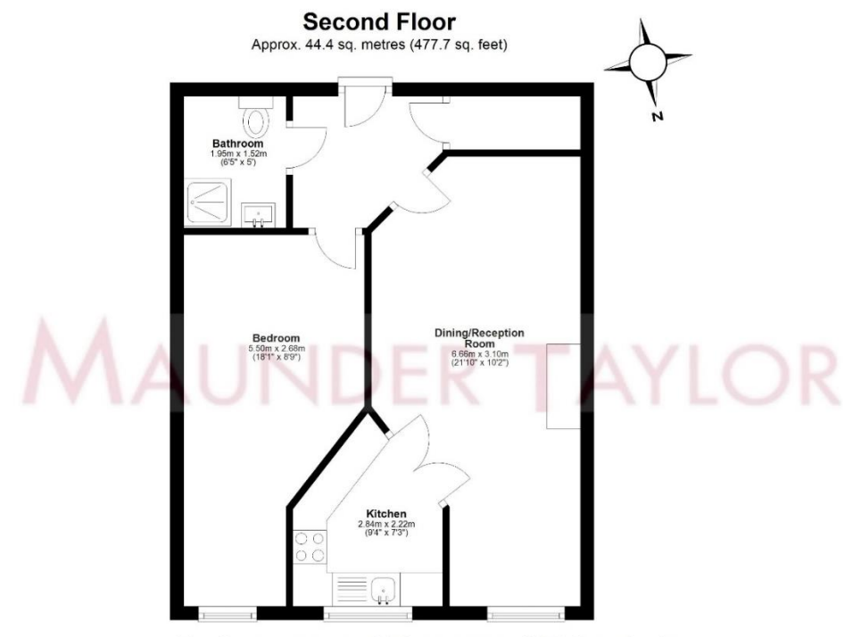
Total area: approx. 44.4 sq. metres (477.7 sq. feet)

Floor Plan measurements are approximate and are for illustrative purposes only. While we do not doubt the floor plans accuracy, we make no guarantee, warranty or representation as to the accuracy and completeness of the floor plan. Plan produced using PlanUp.