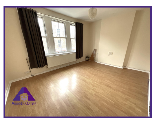
Church Street, Abertillery