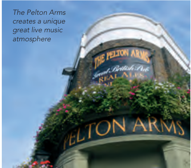
The Pelton Arms creates a unique great live music atmosphere

“Bordering a network of charming early Victorian streets, many of them cobbled”