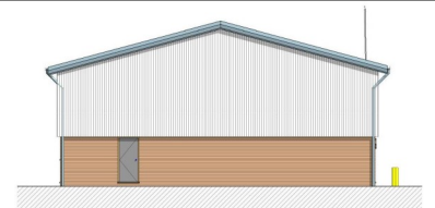
Front (West) Elevation 1 : 100