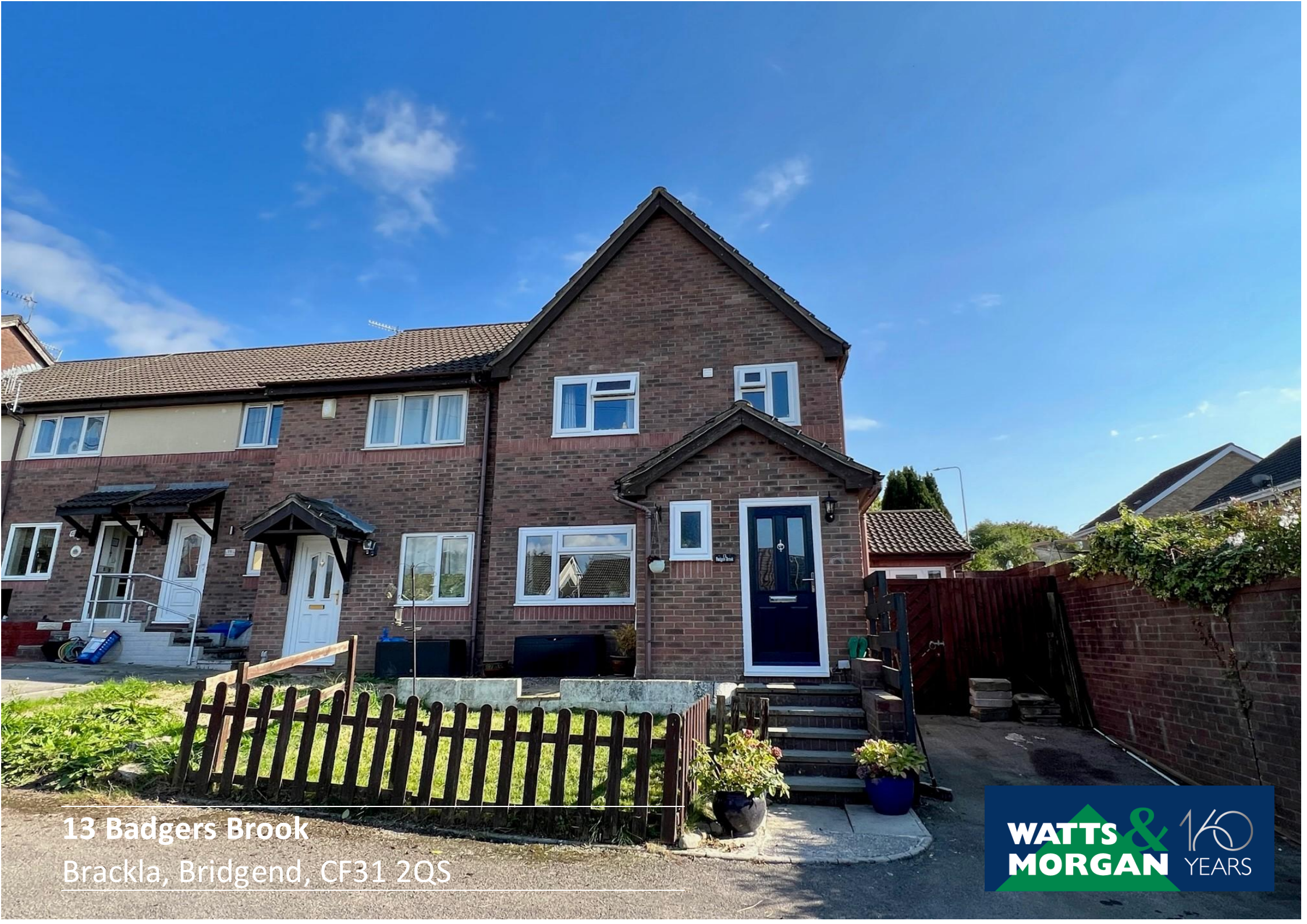
13 Badgers Brook Brackla, Bridgend, CF31 2QS