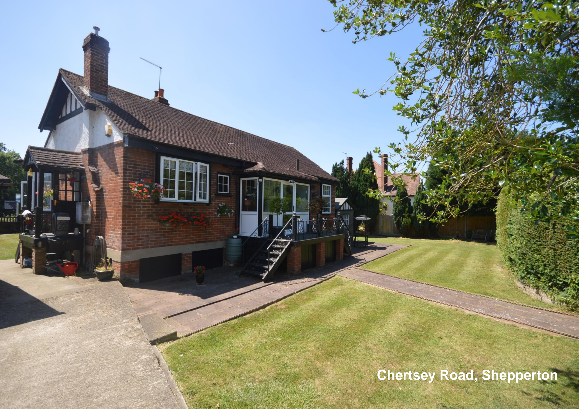
Chertsey Road, Shepperton