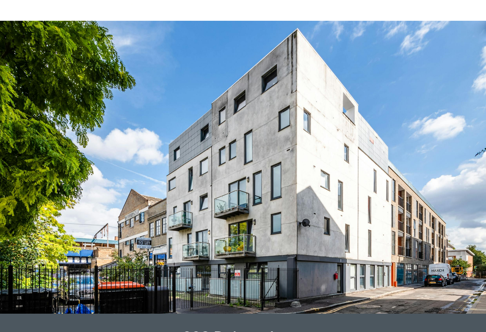
228 Dalston Lane Hackney, E8 1LA

Freehold Investment/Potential Development Opportunity Located in Hackney.