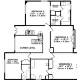
1ST FLOOR 1728 sq ft. (160.5 sq.m.) approx.