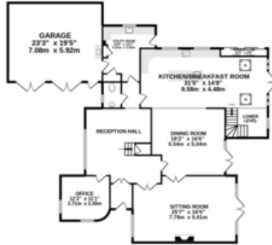
GROUND FLOOR 2399 sq ft. (224.3 sq.m.) approx.