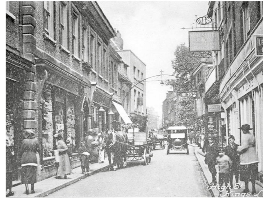
A historic photograph of King's Lynn town.