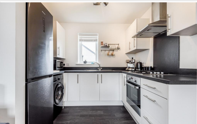
Open Plan Kitchen/Living/Dining Room