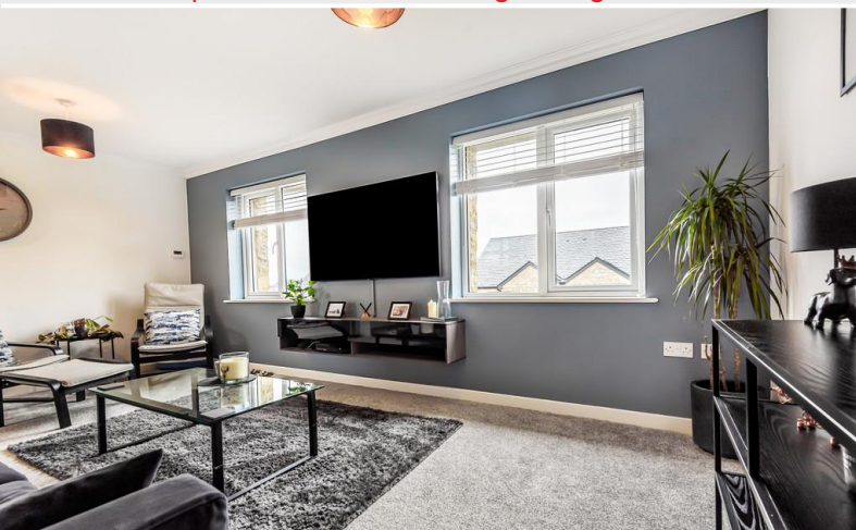
Open Plan Kitchen/Living/Dining Room