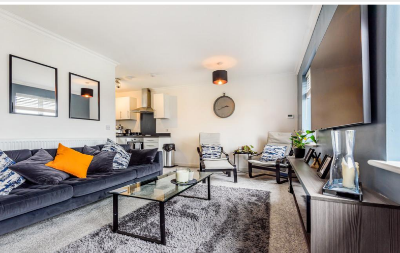
Open Plan Kitchen/Living/Dining Room