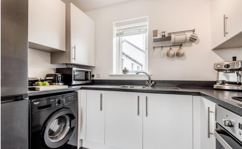
Open Plan Kitchen/Living/Dining Room