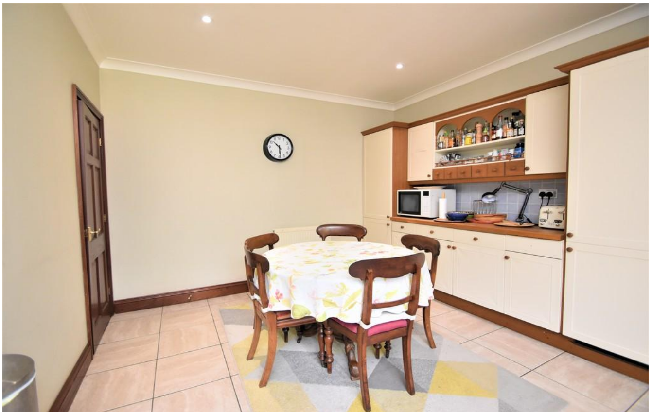
Particulars for 16a Green Close, Chelmsford, CM1 7SL