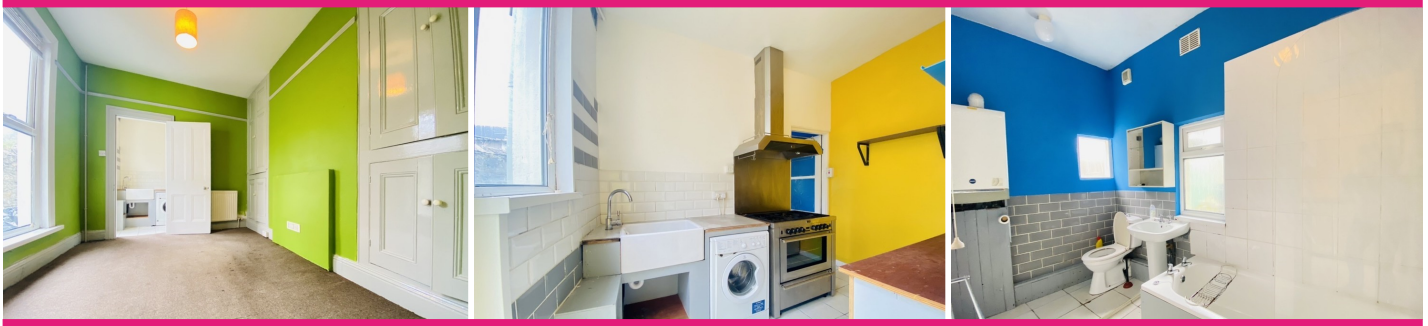
GROUND FLOOR 814 sq.ft. (75.6 sq.m.) approx.