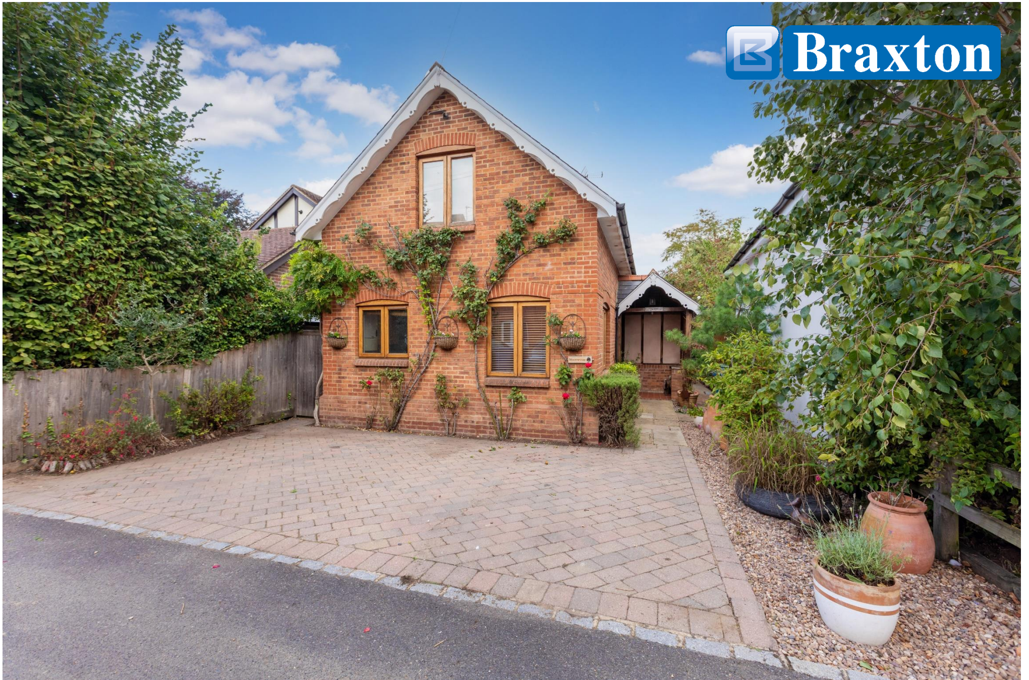
Meadowville, Bakers Lane, Pinkneys Green, Maidenhead, Berkshire SL6 6QQ