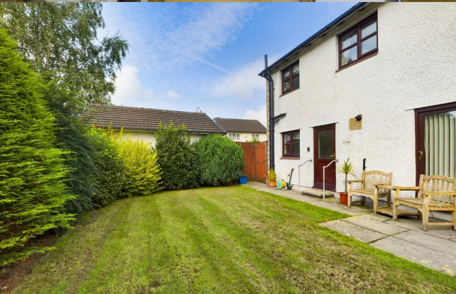
Rear of Property and Garden