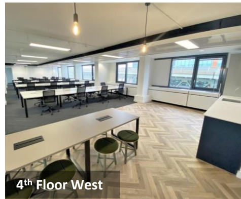
4 th Floor West