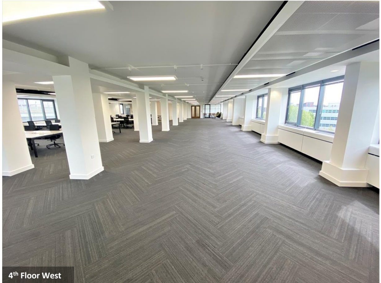
4 th Floor West

Further details and floor plans are available from the agents.