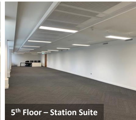
5 th Floor – Station Suite