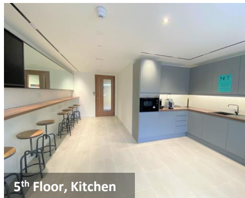
5 th Floor, Kitchen