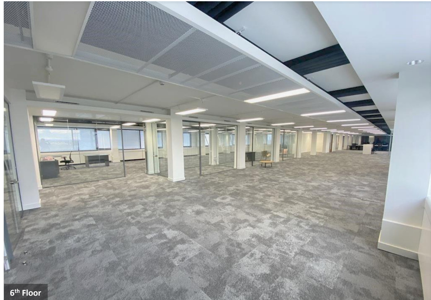
6 th Floor