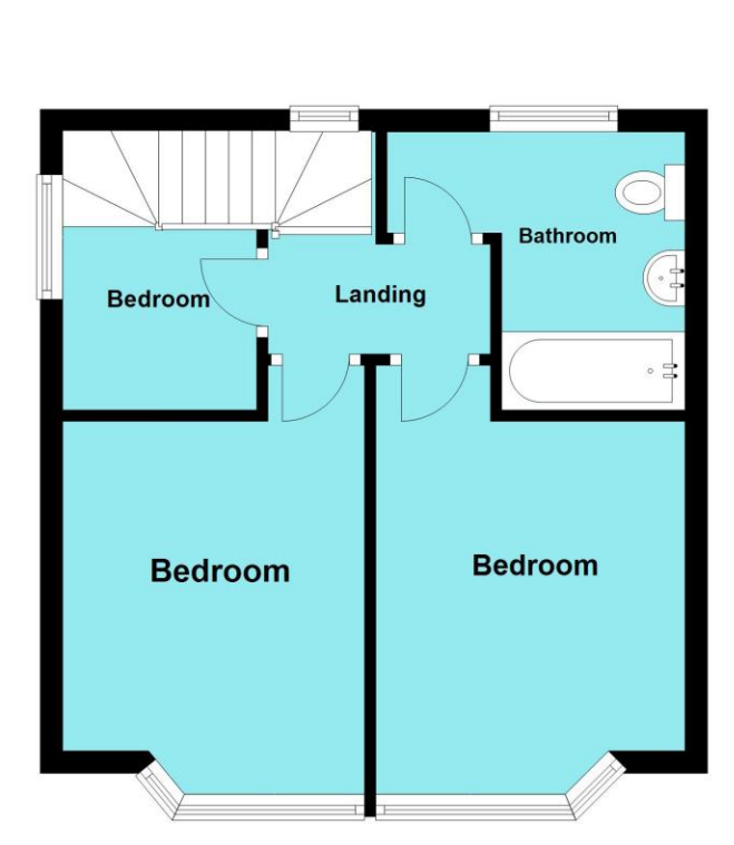
Total area: approx. 65.4 sq. metres (704.1 sq. feet)

Whilst every attempt has been made to ensure the accuracy of the floor plan, measurements of doors, Windows, rooms and any other items are approximate and no responsibility is taken for error Omission or misstatement. This plan is for illustrative purposes only and should be used as such by any prospective purchaser. The services systems and appliances shown have not been tested and no guarantee as to their Operability or efficiency can be given Plan produced using PlanUp.