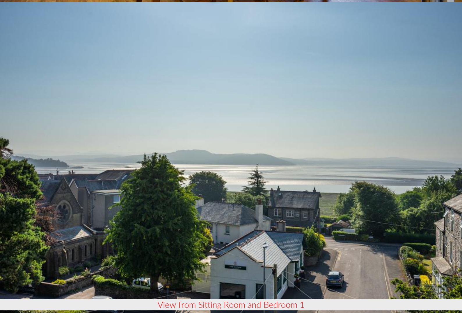
View from Sitting Room and Bedroom 1