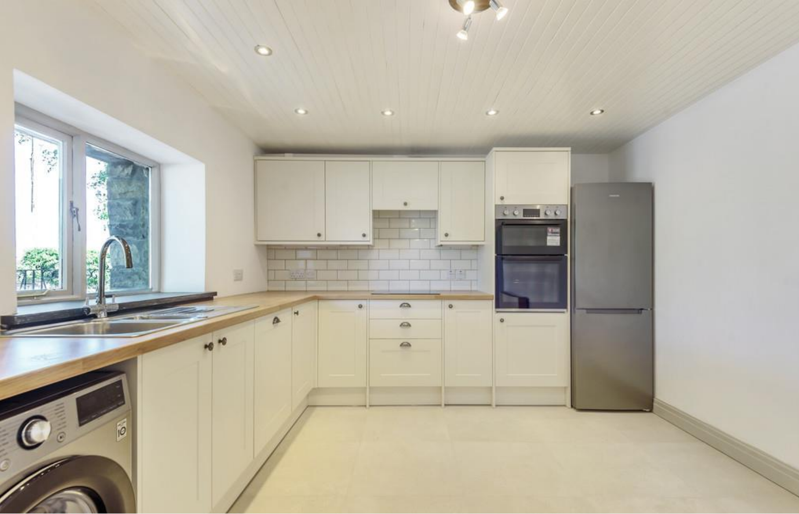
Spacious Kitchen Dining