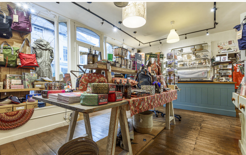
Front Sales Area