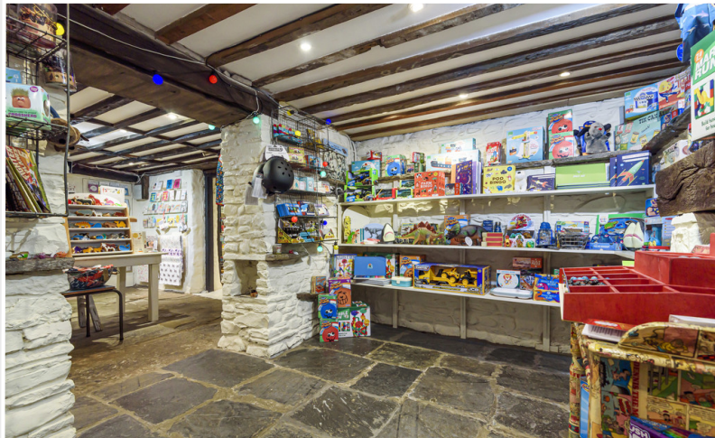
Lower Ground Floor Sales Area