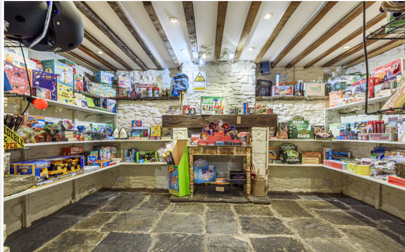
Lower Ground Floor Sales Area