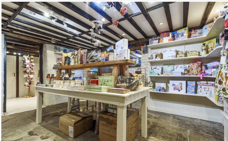
Lower Ground Floor Sales Area