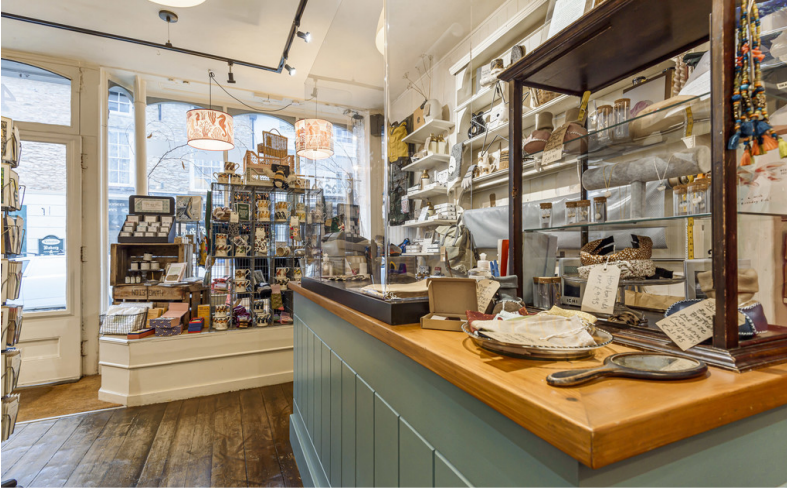
Front Sales Area