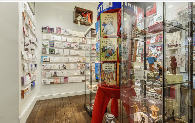
Rear Sales Area