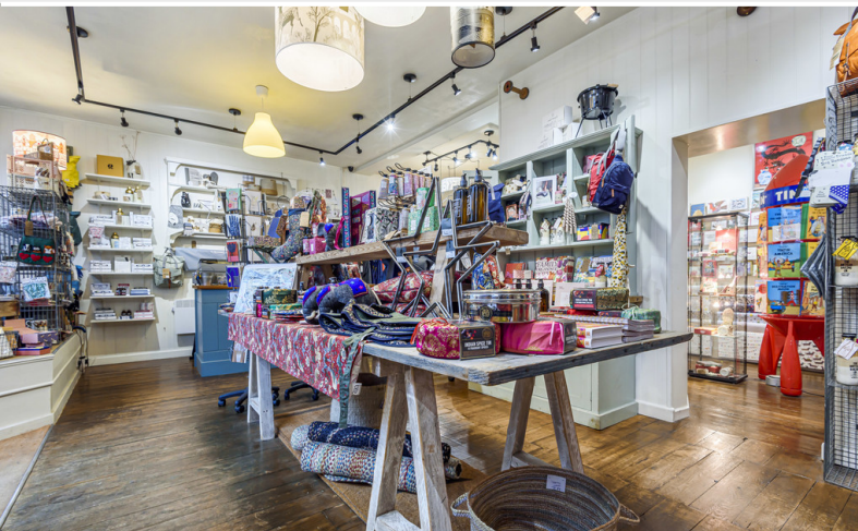
Front Sales Area