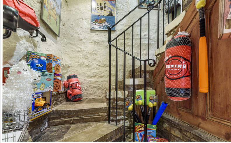
Lower Ground Floor Sales Area

Energy Performance Certificate The full Energy Performance Certificate is available on our website and also at any of our offices.