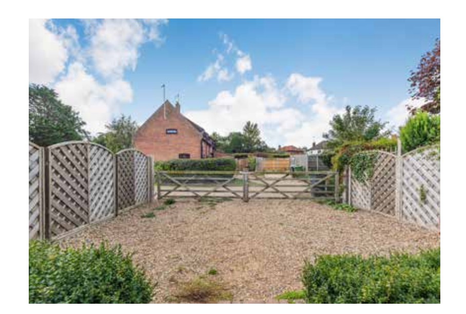
A charming presence...