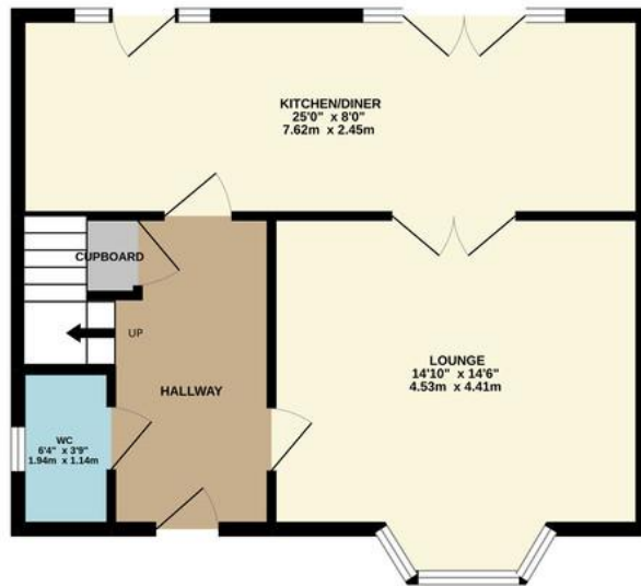
GROUND FLOOR 525 sq.ft. (48.8 sq.m.) approx.