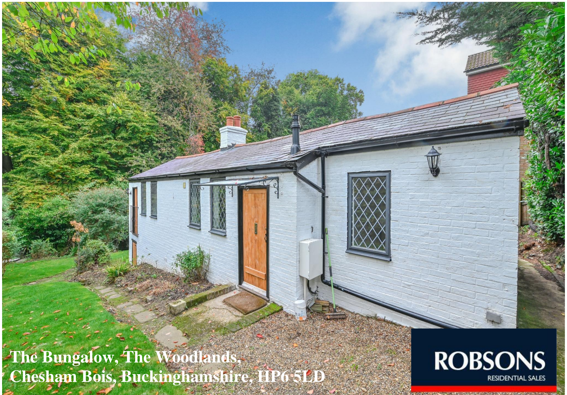
The Bungalow, The Woodlands, Chesham Bois, Buckinghamshire, HP6 5LD