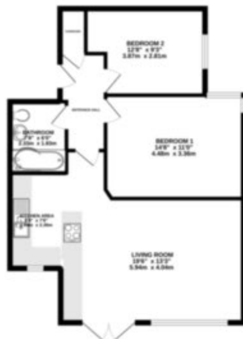
APPROXIMATE MEASUREMENTS. SEE CADASTRE FOR EXACT MEASUREMENTS.