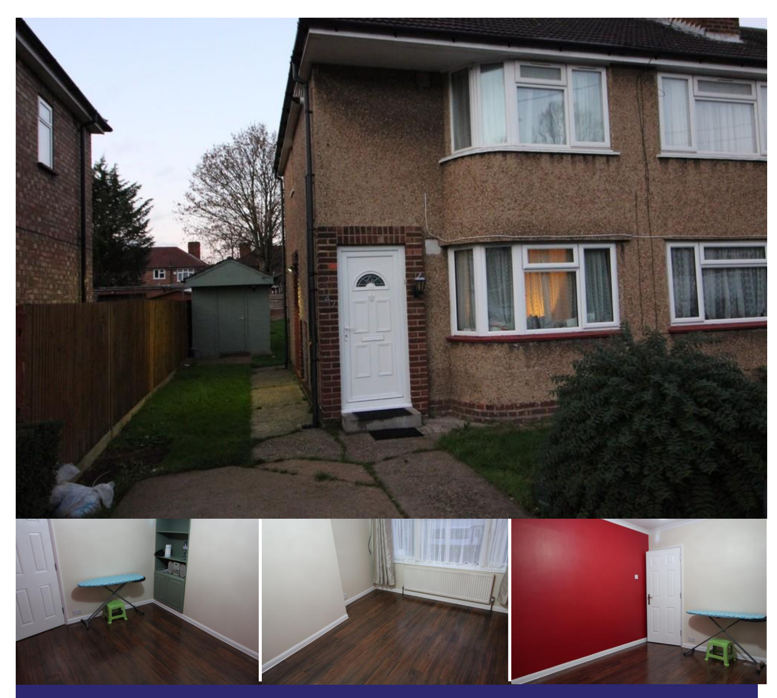
Berwick Avenue | Hayes | UB4 0NJ