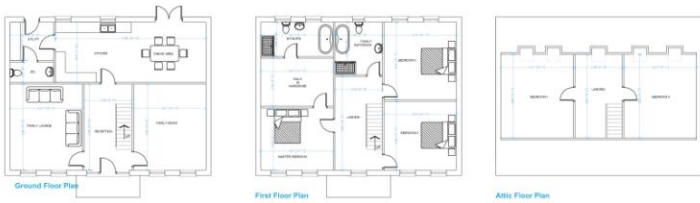
PLOT 1 & 4 INDICATIVE LAYOUT - 1:100 251m 2 Garage 6.0m x 4.5m