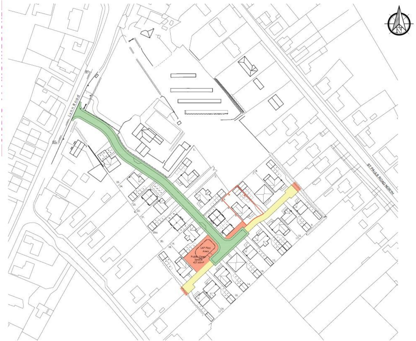
Site Plan with Plot 6 outlined