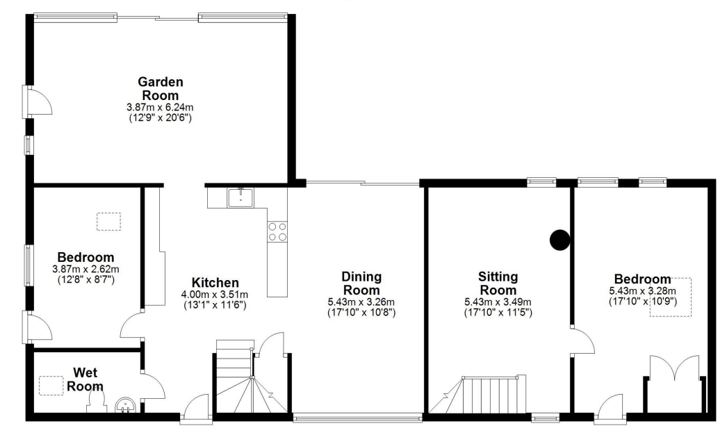
Approx. 114.8 sq. metres (1235.6 sq. feet)