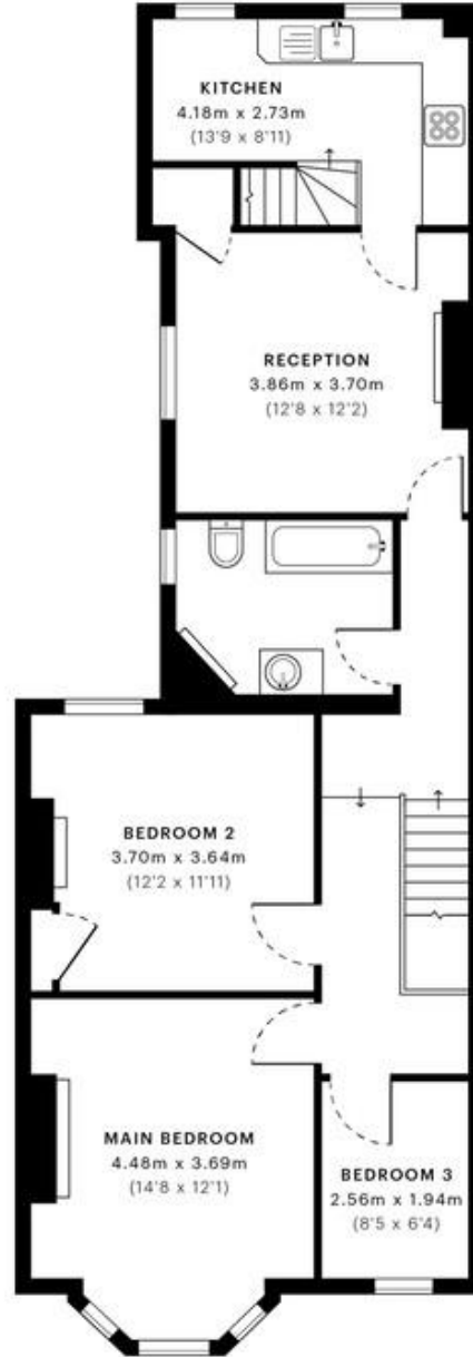
— First Floor