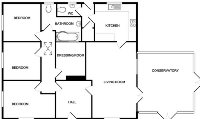
TOTAL APPROX. FLOOR AREA 1344 SQ.FT. (124.9 SQ.M.) Made with Metropix 02020