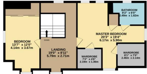
TOTAL FLOOR AREA : 1946 sq.ft. (180.8 sq.m.) approx.

Whilst every attempt has been made to ensure the accuracy of the floorplan contained here, measurements of doors, windows, rooms and any other items are approximate and no responsibility is taken for any error, omission or mis-statement. This plan is for illustrative purposes only and should be used as such by any prospective purchaser. The services, systems and appliances shown have not been tested and no guarantee as to their operability or efficiency can be given. Made with Metropix ©2022