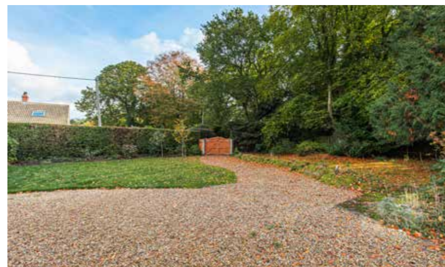
The gardens at Beechcroft

“This home is perfect for a peaceful life and there's plenty of space for the whole family.”