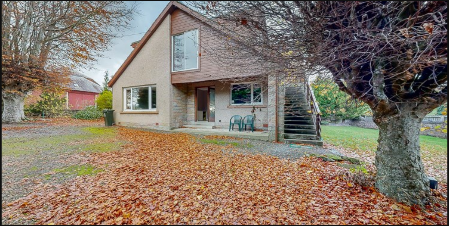
THE BUNGALOW / ROOFTOPS, GLENREE, ALYTH, BLAIRGOWRIE, PH11 8EA

A SPACIOUS 6 BED DETACHED VILLA, WHICH HAS BEEN EXTENDED UPWARDS TO PROVIDE TWO LARGE AND SEPARATE LIVING SPACES. LOCATED ON THE OUTSKIRTS OF THE HISTORIC TOWN OF ALYTH, AND PROVIDING EASY ACCESS TO THE LOCAL AMENITIES.