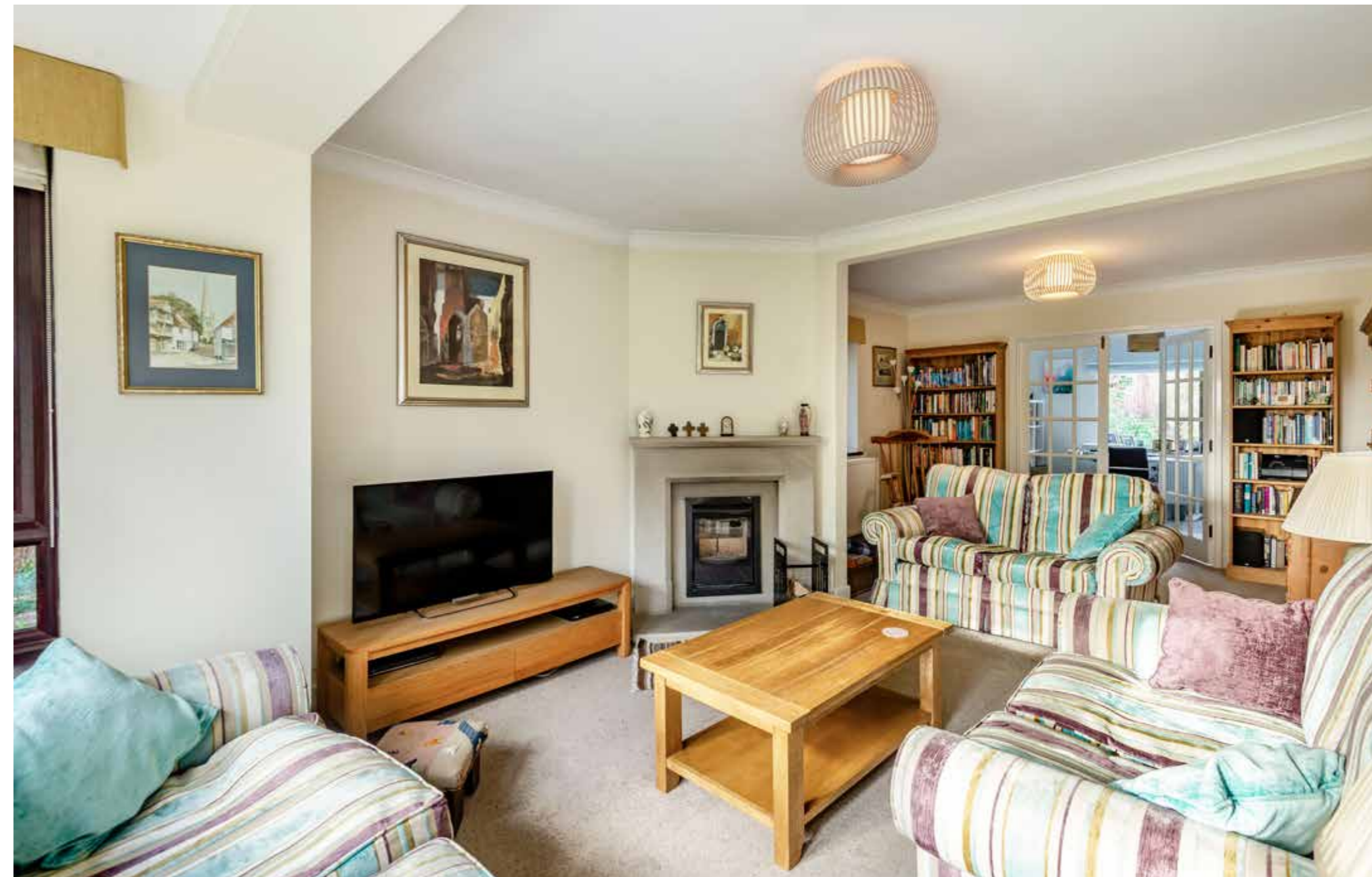
“The living room features an open fire making it a particularly cosy room, often used by the family to watch television...”