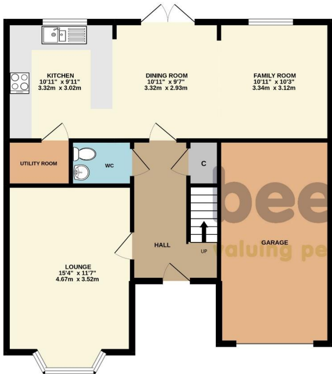
1ST FLOOR 843 sq.ft. (78.3 sq.m.) approx.