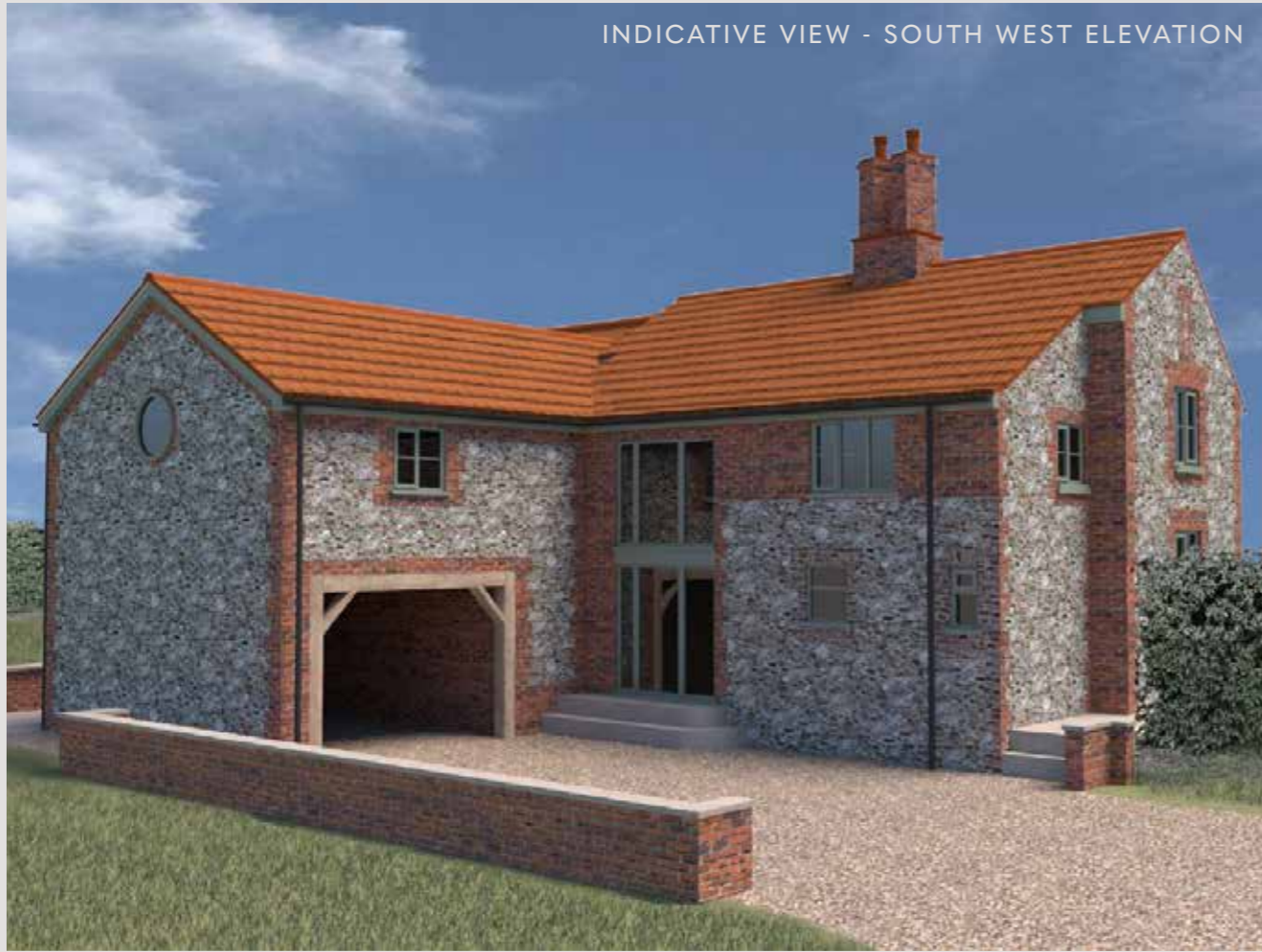
INDICATIVE VIEW - SOUTH WEST ELEVATION