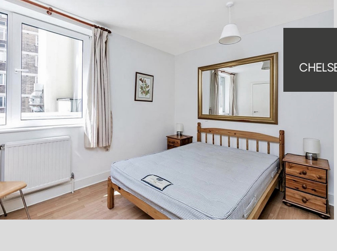
CHELSEA CLOISTERS, SLOANE AVENUE, CHELSEA, LONDON, SW3