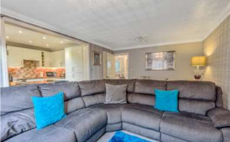
Open Plan Living/Dining Room