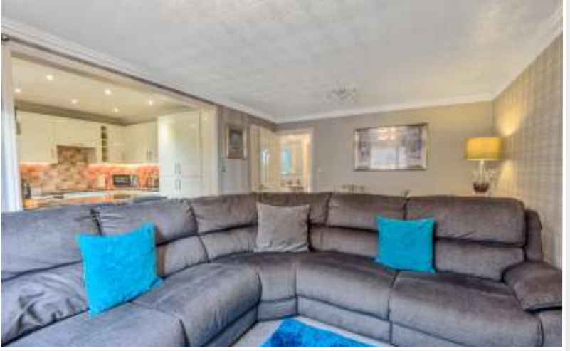
Open Plan Living/Dining Room