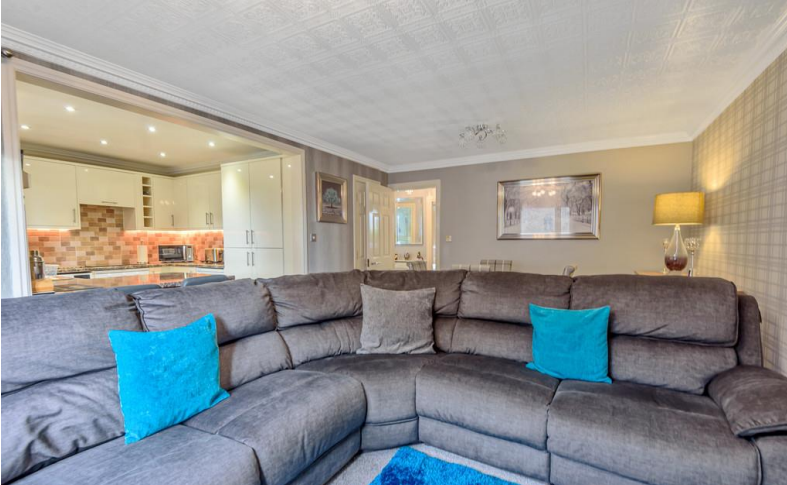
Open Plan Living/Dining Room