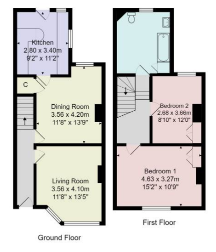
Total Area: 88.5 m² ... 953 ft² All measurements are approximate and for display purposes only. No liability is accepted by either the agency or Box Property Solutions Ltd as to the exact measurements of the rooms. Box Property Solutions Ltd retains the copyright on this plan and allows agents to use it with agreed permission.