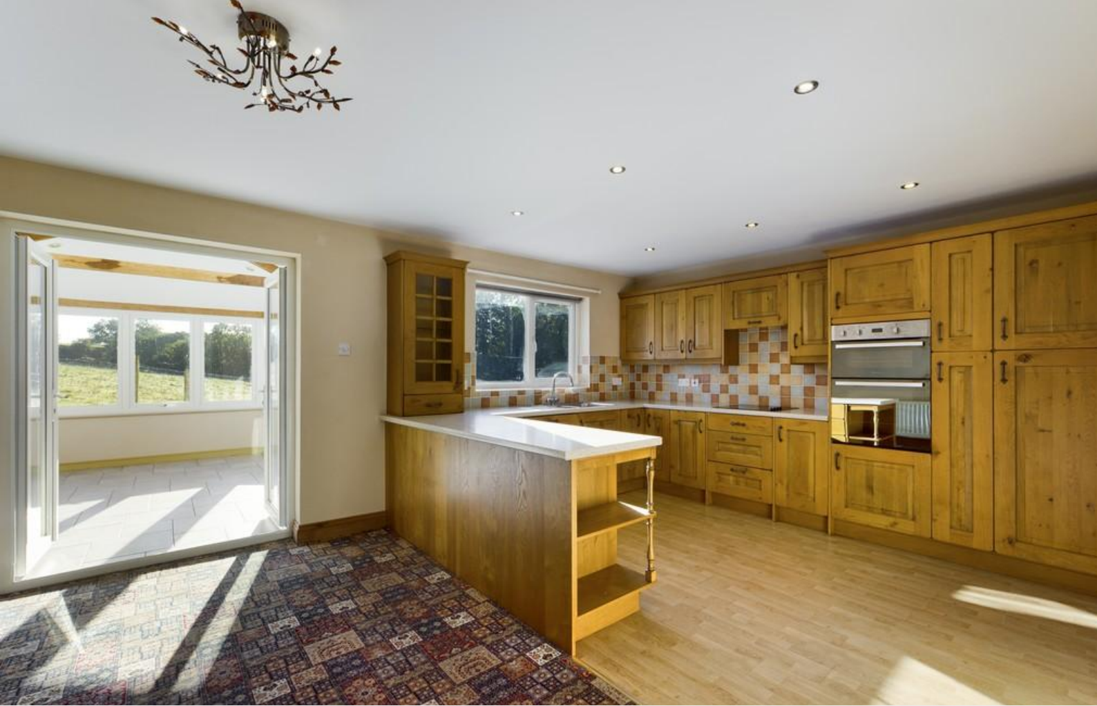
Kitchen Dining Room