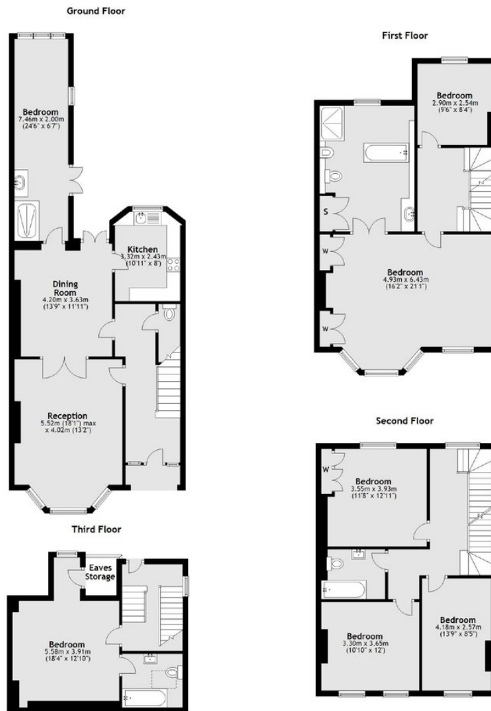
Total area: approx. 225.6 sq. metres (2428.2 sq. feet)