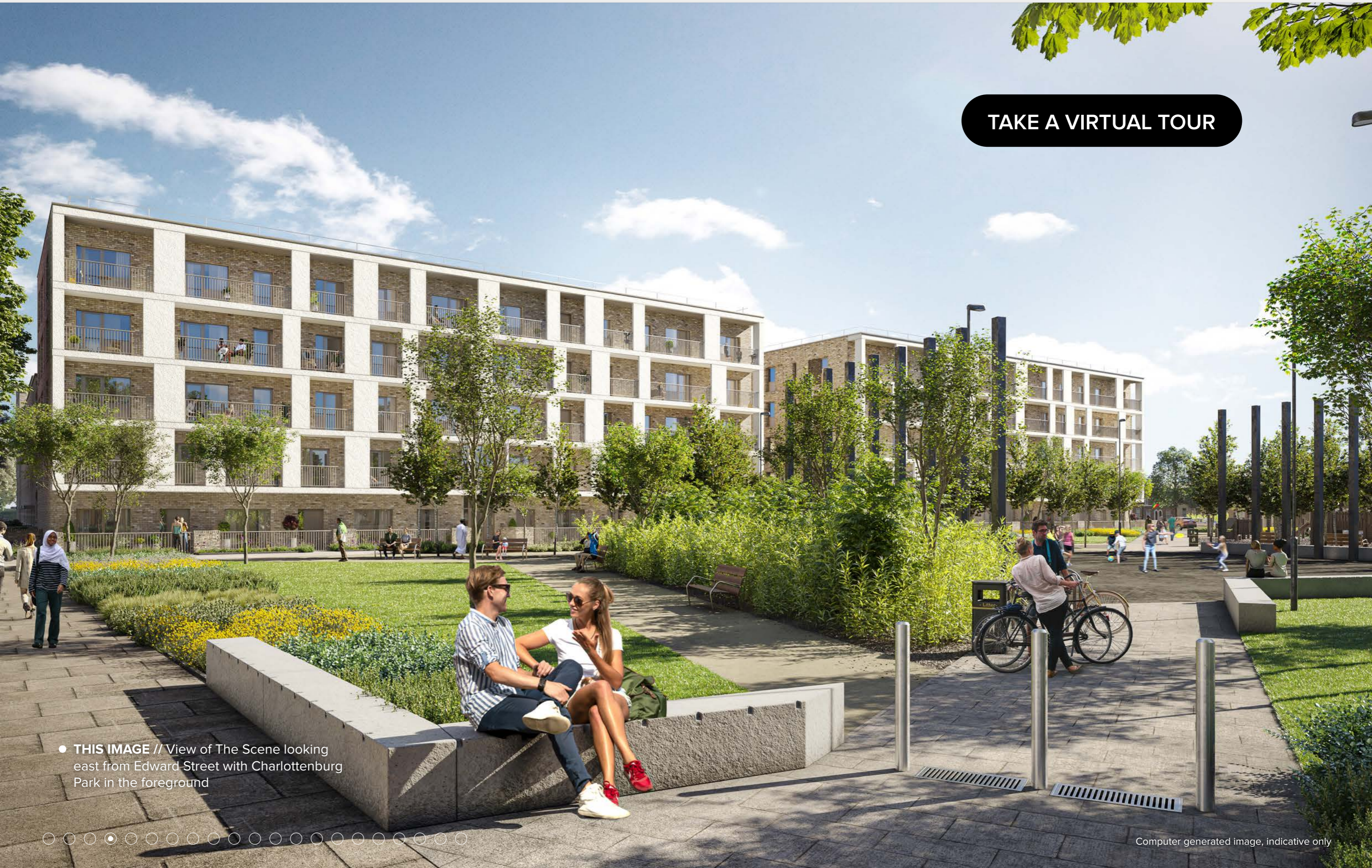
● THIS IMAGE // View of The Scene looking east from Edward Street with Charlottenburg Park in the foreground