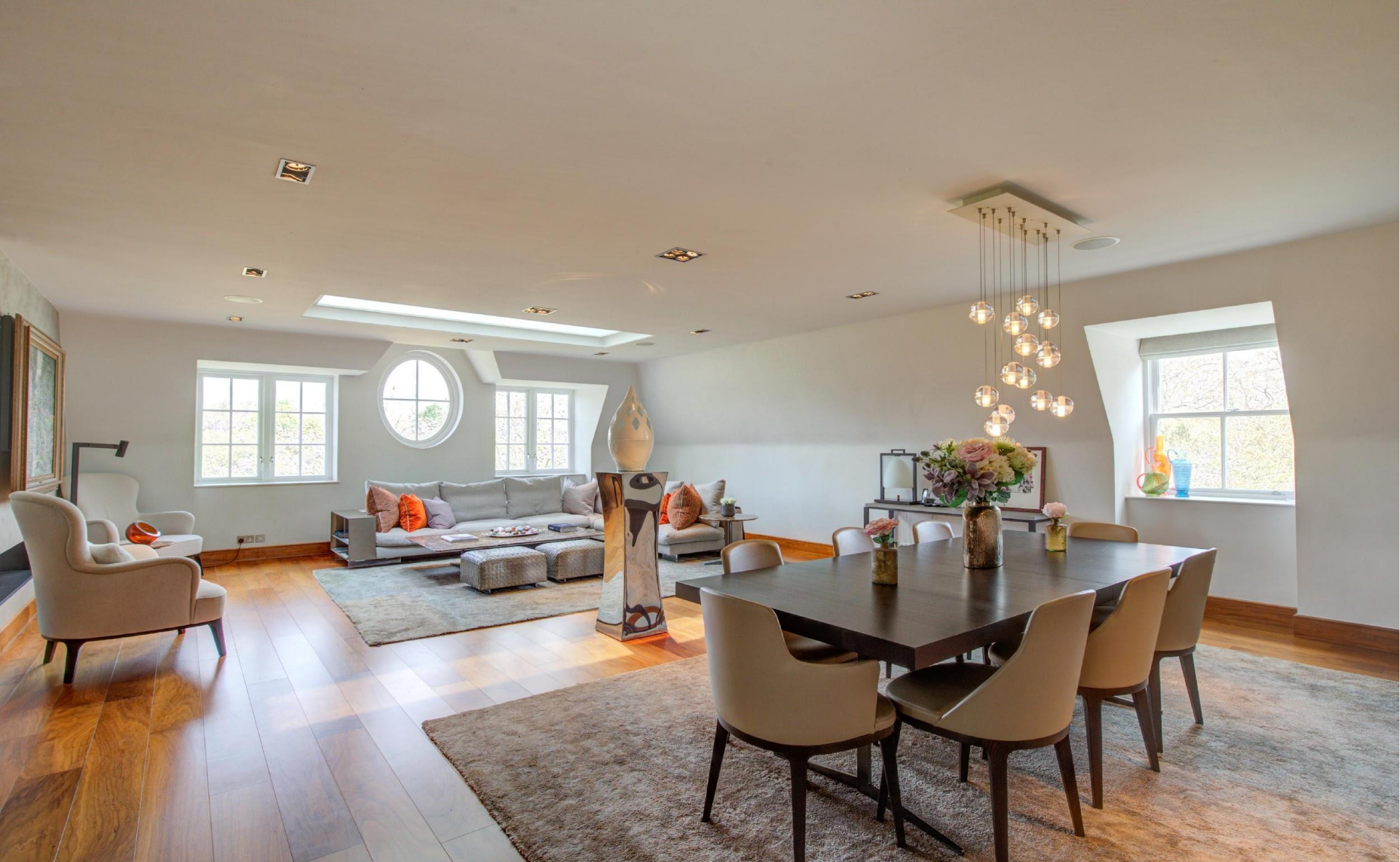
1 Palace Gate, London Asking Price: £6,950,000 (Offers In Excess Of)