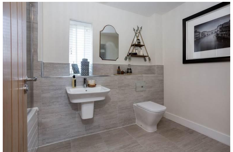
All internal photos are of the 'Barrington' showhome to give example of finish and specification